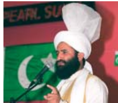
④ Turban usually called a Kullab.