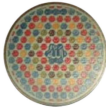
➤ Brass plate with the 99 names of Allah (SWT).