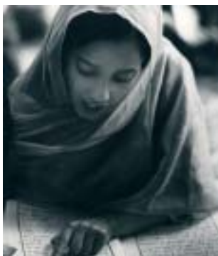
④ Muslim girl reciting the Qur'an.