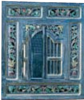
➤ A traditionally crafted wooden mirror.