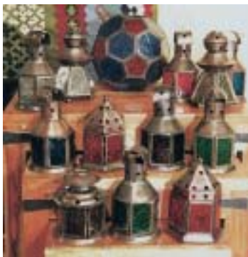
➤ Decorative hand made Qindeels.