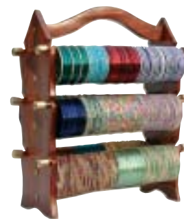
➤ Colourful bangles on a wooden stand.