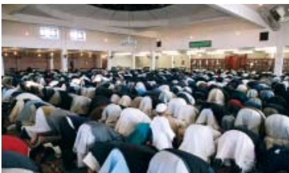
④ Muslim worshippers offering the Eid prayer.