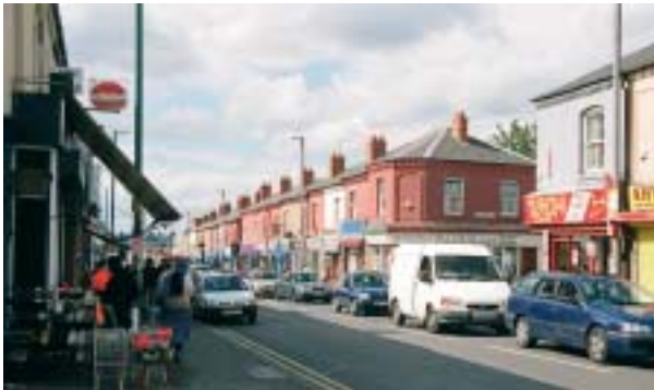
📍 A busy street in Alum Rock.