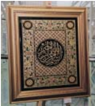
④ Islamic calligraphy.