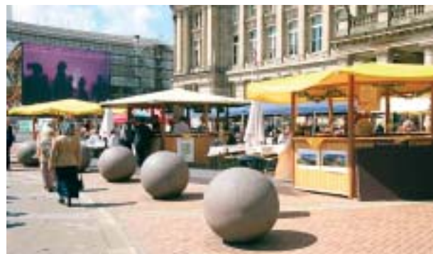
📍 Victoria Square, Birmingham City Centre.