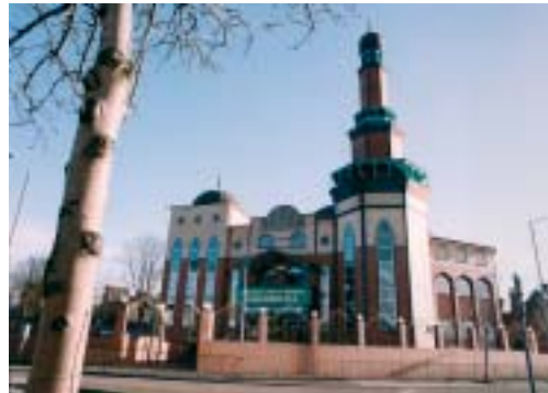
📍 Central Jamia Mosque, Birmingham.