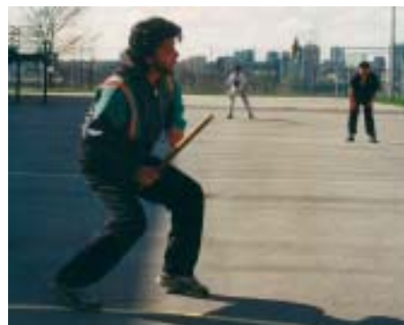
➤ Teams playing Gulli Danda.