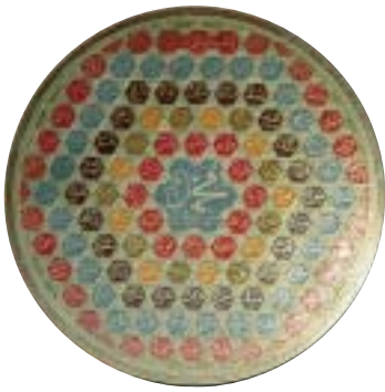
➤ Brass plate with the 99 names of Muhammad ﷺ (PBUH).