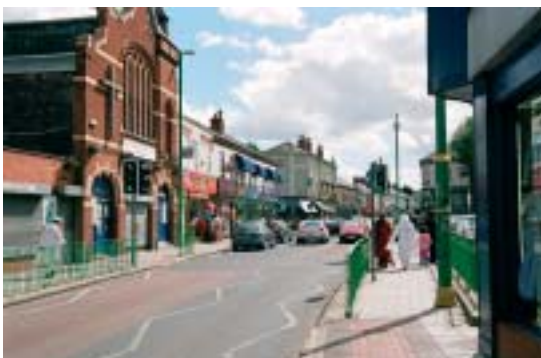
📍 Ladypool Road, Balsall Heath, Birmingham.