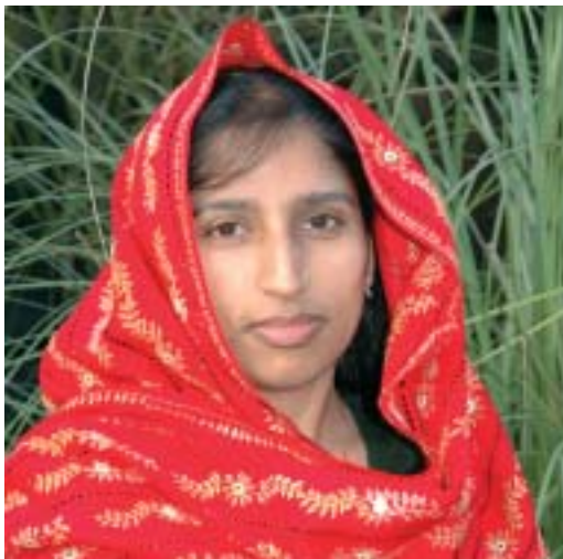
① A Jat girl wearing pashmina shawl.