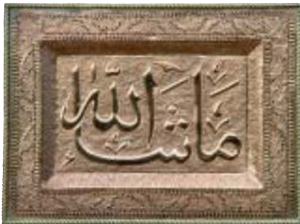
➤ Islamic calligraphy engraved on copper.