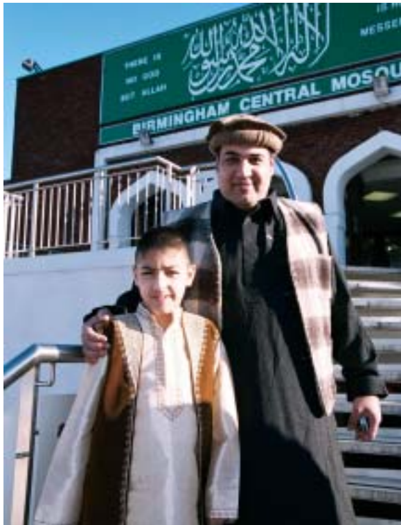
④ A Muslim worshipper with his son.