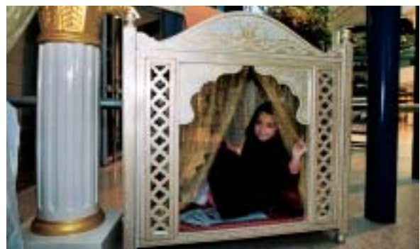
④ A 'Doli' used by a bride to travel to the groom's house.