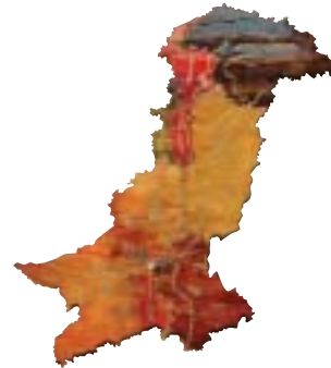
➤ A clock designed by a local artist as a map of Pakistan.