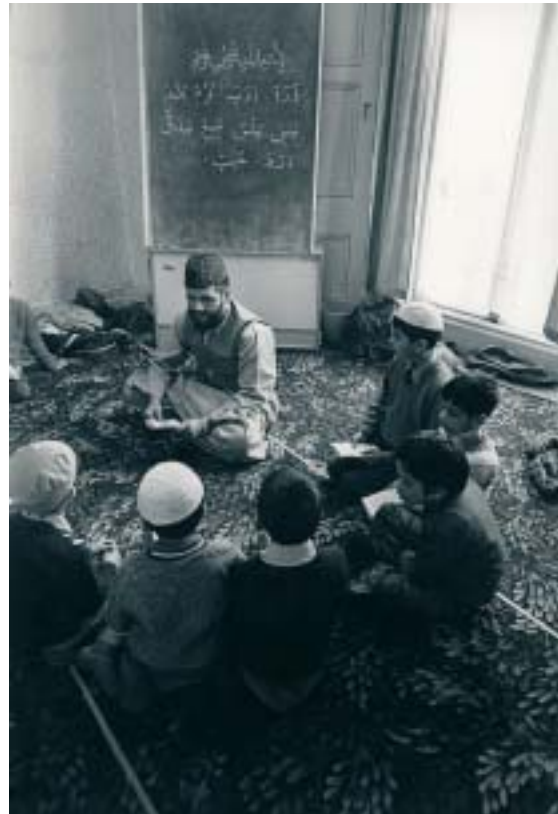
④ Children are taught the Qur'an and prayer.