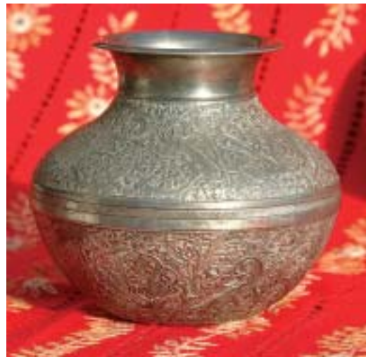
① Silver embossed pot usually used for holding drinks.